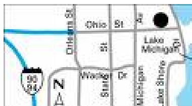
Location of Chicago City Centre