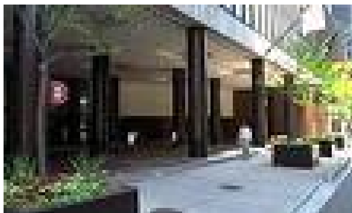
Chicago City Centre

*To reserve a room at the hotel, please call the Holiday Inn City Centre at 312.787.6100 and mention the Illinois Council on Continu-