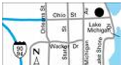
Location of Chicago City Centre