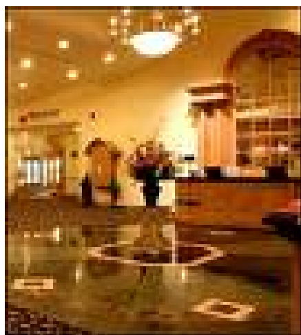
Chicago City Centre