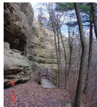
Starved Rock State Park

web page, www.icche.org , for instructions) or phone 618-536-7751.