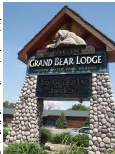
Grizzly Jack's Grand Bear Resort and Indoor Waterpark, at Starved Rock

Grizzly Jack's is offering a special ICCHE/ICCET conference rate of just $89 for lodging.