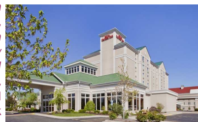
Hilton Garden Inn, Champaign, IL