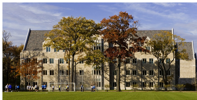
Dominican University, River Forest, IL

J oin colleagues for the 2014 Northern Region Symposium scheduled for Friday morning, April 11, from 9 AM to 12:30 PM at Dominican University at 7200 West Division Street in River Forest, IL.